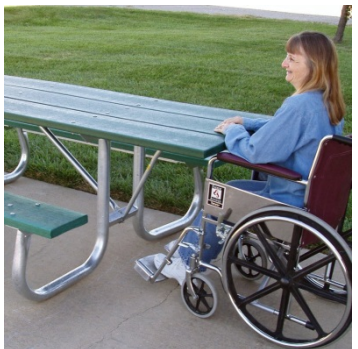
Accessible picnic table